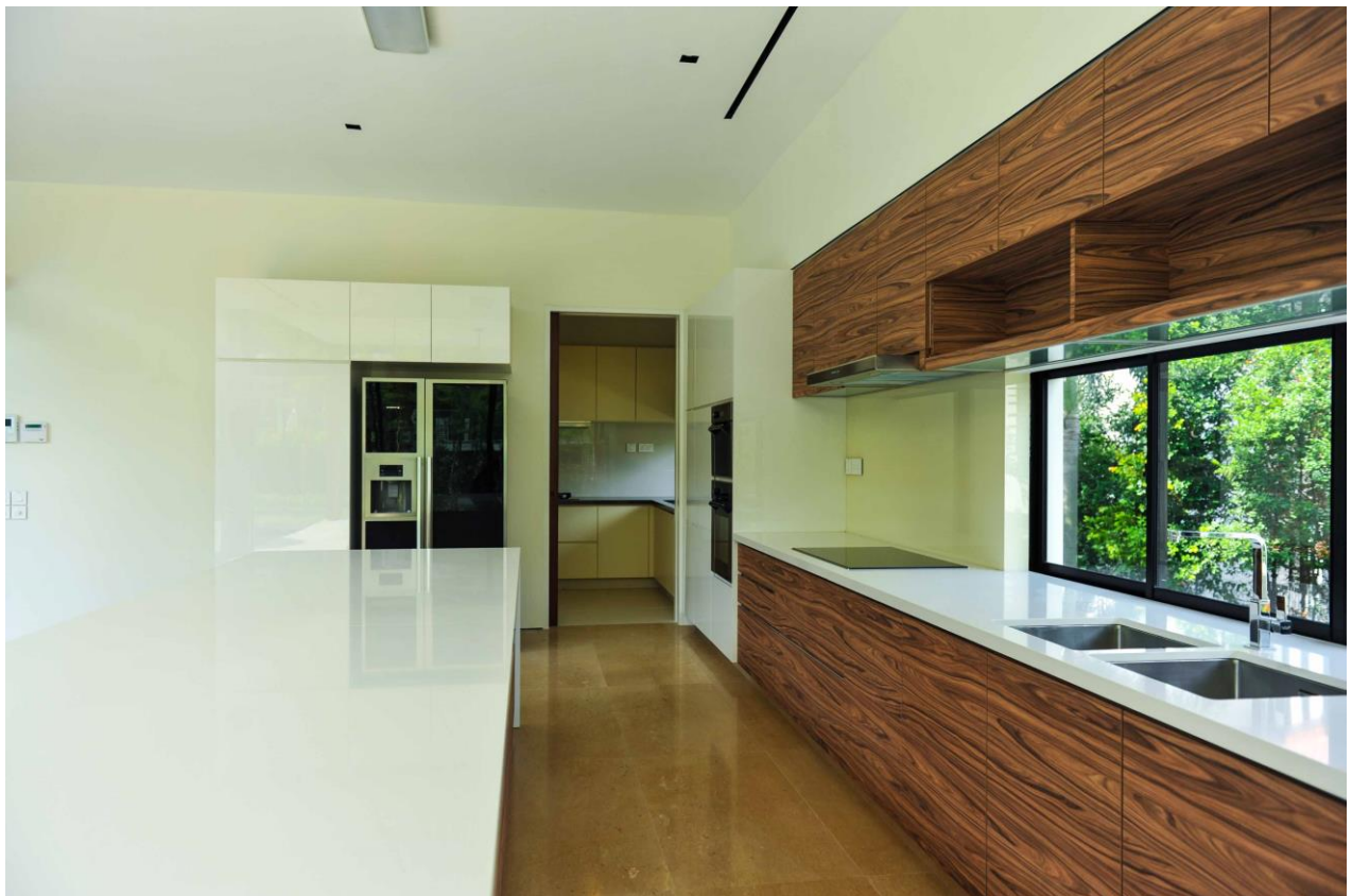
Dry and Wet Kitchen